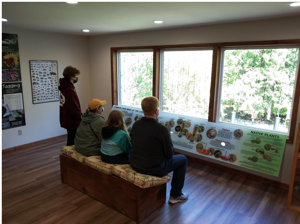
Photo: Exciting new viewing window at the freshly renovated Lake Erie Islands Nature & Wildlife Center! Make sure to add the Ribbon Cutting scheduled for Sunday, August 15 @ 2:00 pm to your IGW must do adventures!!

Become an LEIC Member for just $25 for an entire year! Email leiconservancy@gmail.com for details.