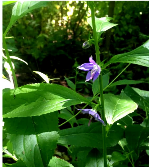
Tall Bellflower in the new Cooper's Woods Preserve